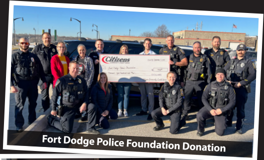
Fort Dodge Police Foundation Donation

In addition to these recent donations, Citizens and our employees made an MPACT in 2023 by supporting more than 100 different community organizations and foundations across our region through financial contributions, resource donations and more than 1,000 hours of volunteer efforts. Moving into 2024, we are challenging ourselves to improve upon these numbers and are looking forward to making an even larger MPACT in the lives of our members and in our communities.