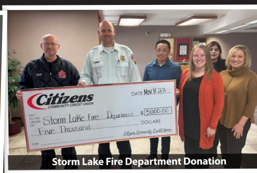
Storm Lake Fire Department Donation