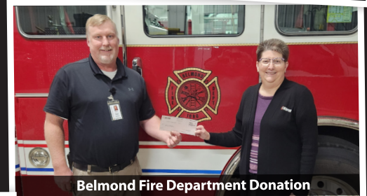
Belmond Fire Department Donation