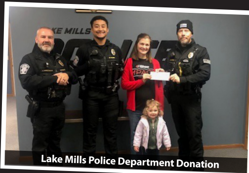
Lake Mills Police Department Donation