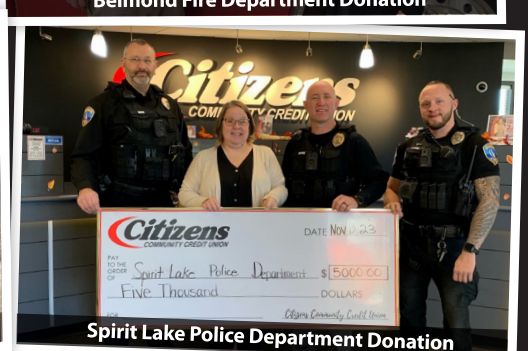
Spirit Lake Police Department Donation