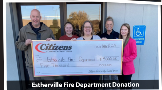
Estherville Fire Department Donation